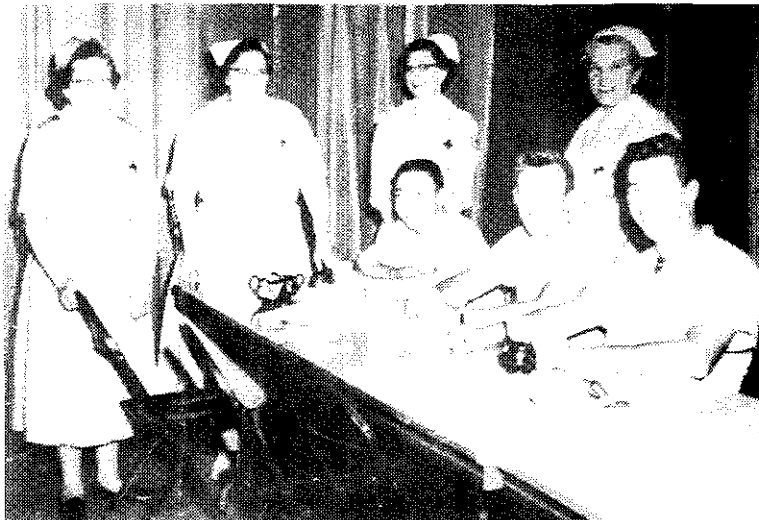
These fellows were happy, as can be seen from their smiling faces, to give blood to Multi-Lakes Blood Bank. Won't you visits M.L.C.A. clubhouse, 4 to 10 p.m.

will be used by members or their families who are ill or injured, and whose doctor may use pint after pint to pull them through illness and operations.